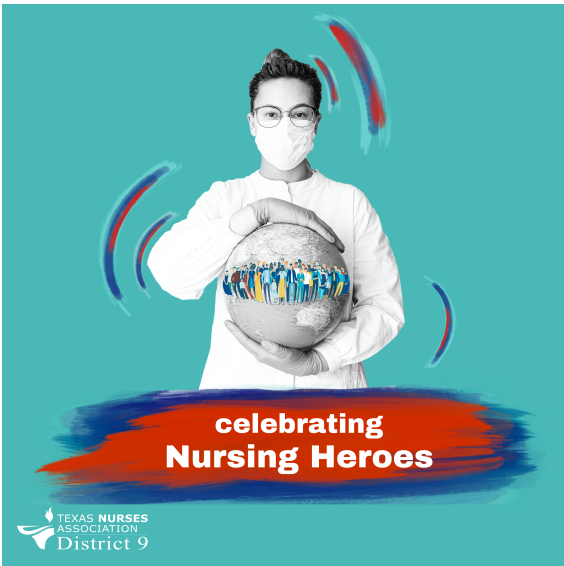
Cutline 1: Honoring Nurses who served without Fear or Hesitation during COVID 19 pandemic.